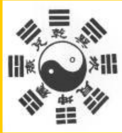
The Early Days Bagua