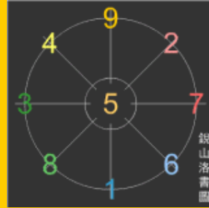
Master Lau's Lok Shu Diagram